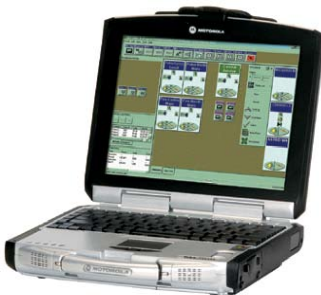
The ML 910: Motorola's most advanced mobile laptop

When your success depends on efficiency and responsiveness—like needing immediate feedback on production requirements or timely coordination from management to foreman—you can depend on the MIP 5000 radio console to keep your staff connected with clear, effective, economizing communications. Designed for the multi-campus corporate manufacturer, university campus site, hotel complex or remote construction field office, Motorola's MIP 5000 deployable VoIP radio console provides an easy and affordable way to manage communications without delay anywhere a network connection is available.