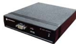
MIP 5000 Gateway

From a networked desktop computer in the main building or control room to a laptop in the field office, the MIP 5000 radio console allows campus security or construction personnel to talk and listen to all radio traffic wherever a network connection is available. While one user may have access to just one channel, a project manager can have access to all 8 channels, allowing for easy on or off-site monitoring and communication. And when a situation requires patching radios together, the MIP 5000 radio console uses an easy drag and drop action to allow even radios from different manufacturers to talk to each other.